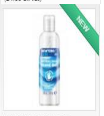
Newtons Lab Hand Sanitiser 100ml