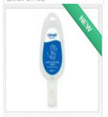
Hand Sanitising Liquid 60ML