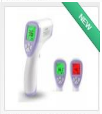
Infra Red Thermometer (Non-Contact)