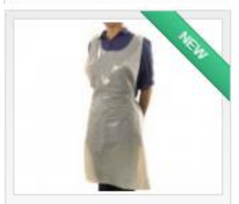
Disposable Polythene Apron x 500