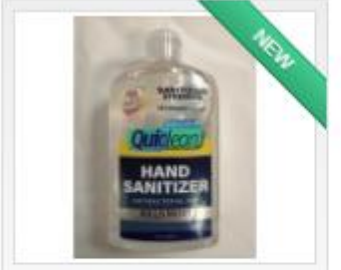
Hand Gel - 500ML Bottle