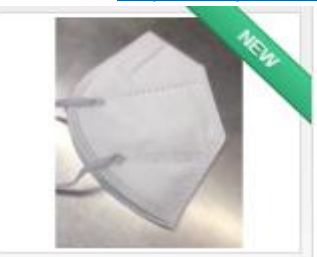
KN95 FFP2 Surgical Mask