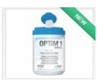
Optim 1 Disinfectant Wipe (160)