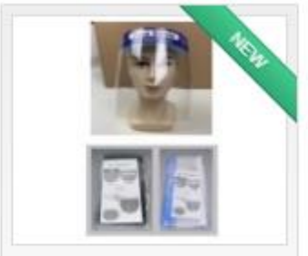
Face Shield (Visor)