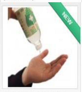
Alcohol Hand Gel 80% 500ml