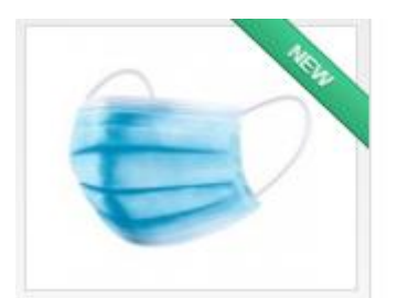
3 Ply Ear Looped Face Mask (50)