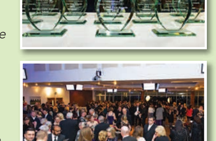
The winners trophies (top) and the Champagne Reception in the Diomed Suite

...Providers large or small, and even those in competition with each other for the awards, were supportive of each other and cheering everyone on (although perhaps sometimes through a fallen smile!). The whole evening was a feel-good event and a much needed boost in these challenging days of social care.