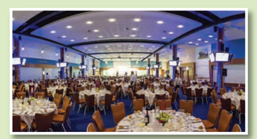
Oaks Hall was our stunning new Awards venue