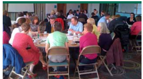
7 April 2011 - Partnership Board Public Value Review Engagement Meeting